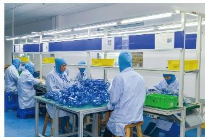
Mask Kit Packing