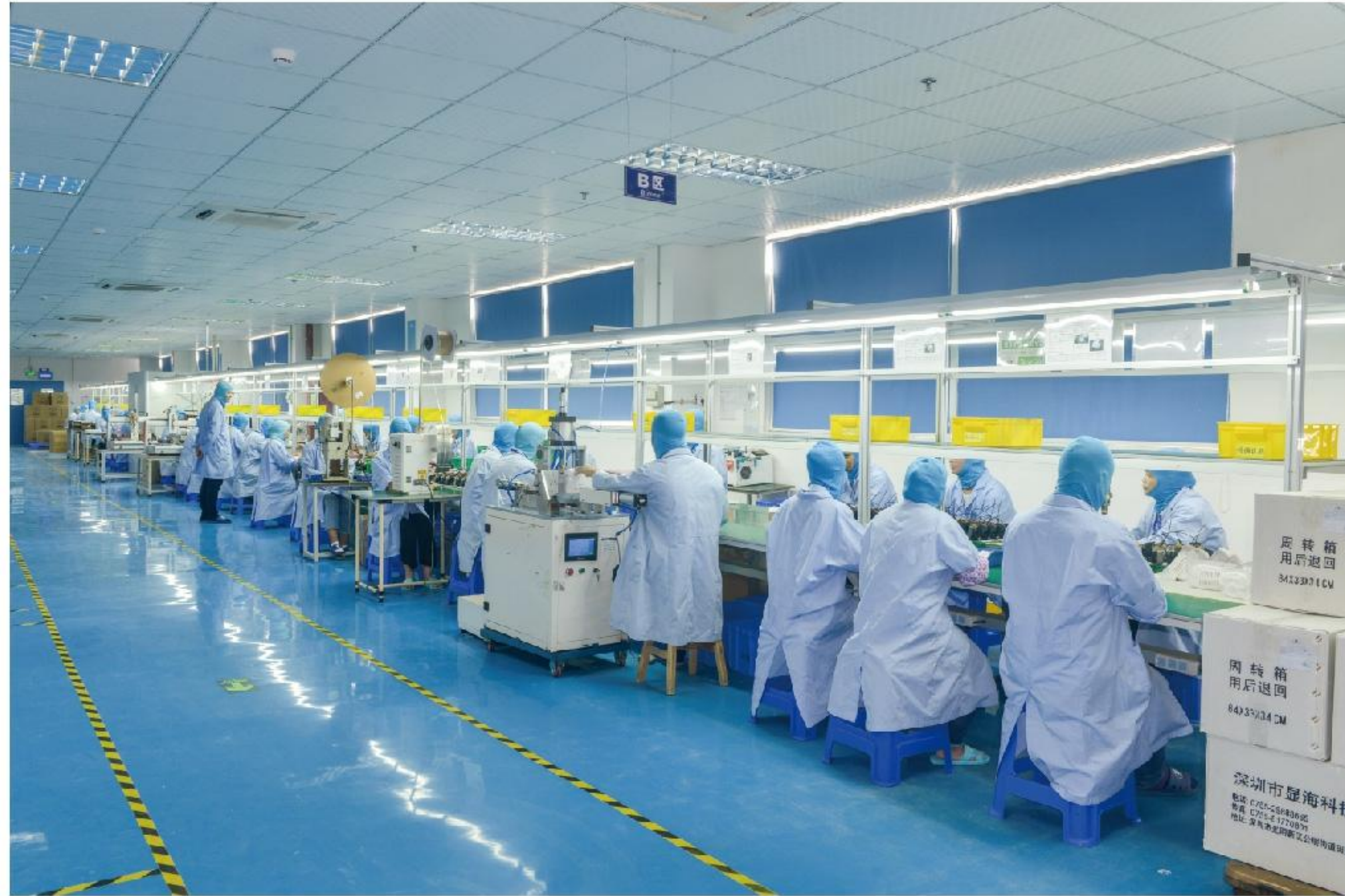
Nebulizer Assembling Workshop